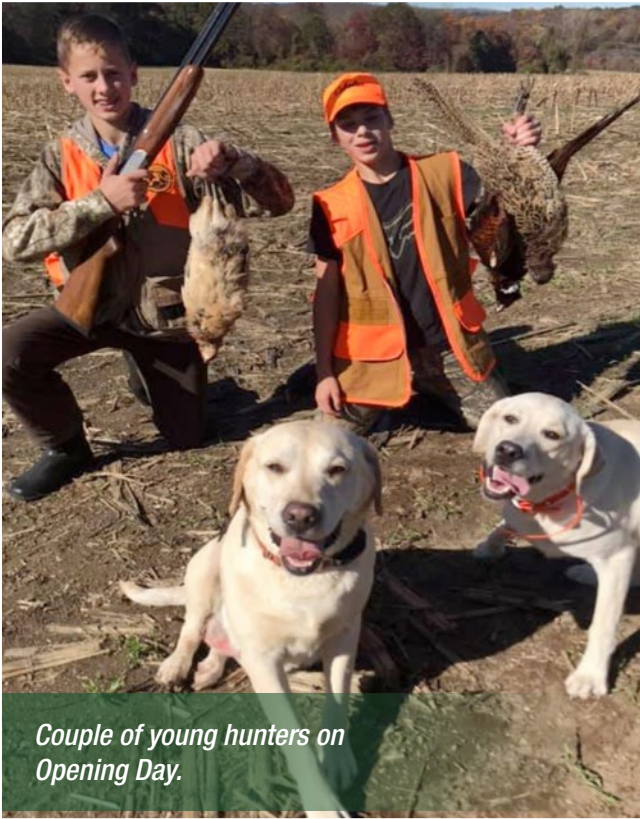
Couple of young hunters on Opening Day.