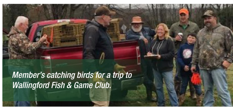
Member's catching birds for a trip to Wallingford Fish & Game Club.