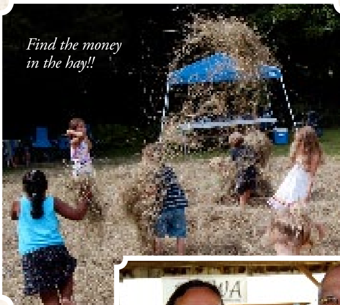
Find the money in the hay!!