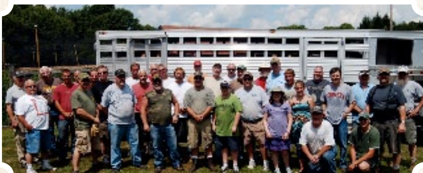
Pheasant season is ensured by a great crew of workers!