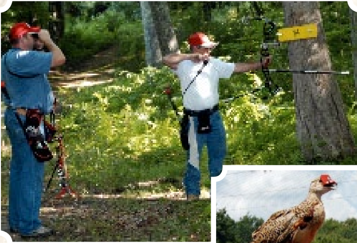
Shooting true on the archery course.