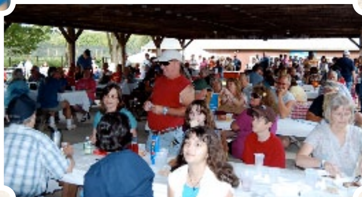
Tables were crowded at the Family Picnic.