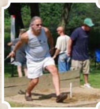
Munch', ready to toss one of many ringers!