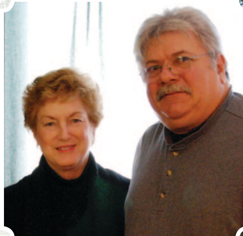
Governor Jodi Rell attended the Fin's annual game dinner.

The 50th anniversary of our Club is coming July 10th. This is going to be BIG so don't miss out on one of the best events this year. It's been my pleasure to serve you in the last 6 months.