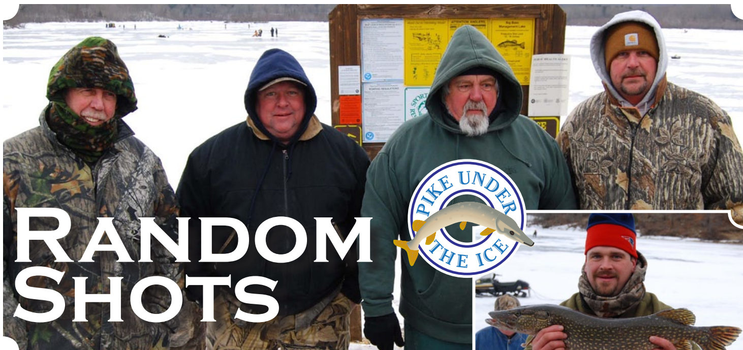
The 5th annual Pike Under the Ice Tournament took place on February 6th at Mansfield Hollow.