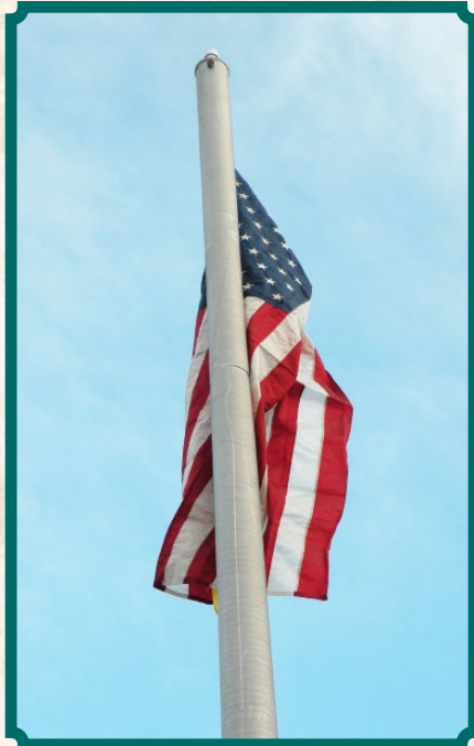
The retired flag was burned the night before, and this new one rose in its place.