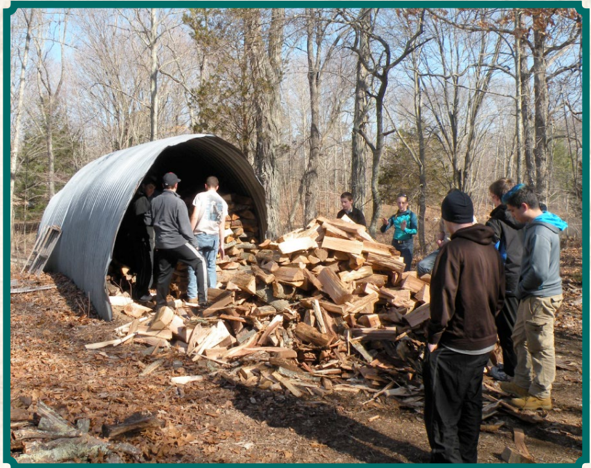
The Crews also do a service project for the club each time the event occurs as a thank you. This year they stacked the wood.