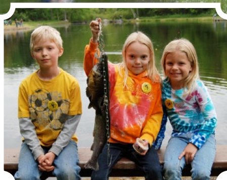
Above: Another great turnout for the Fin's Annual Fly Fishing Tournament