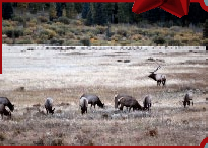
Bull elk with harem