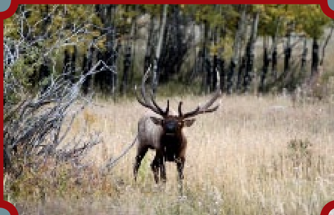
Rocky Mountain bull elk bugling