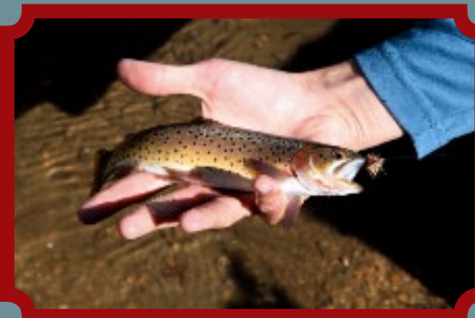
Rocky Mountain cutthroat on a caddis fly